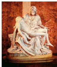
'Pieta' Michelangelo (1498-1499)

Michelangelo created two very famous statues marble, a type of stone. 'The 'Pieta' (the piety) is still inside Saint Peter's Basilica, a church in the Vatican. It is a statue of the body of Jesus on the lap of his mother Mary after the crucifixion.