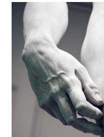
David' Michelangelo (1501-1504)

Michelangelo's sculptures are very realistic. He paid close attention to details such as the veins on the sculpture's hands.