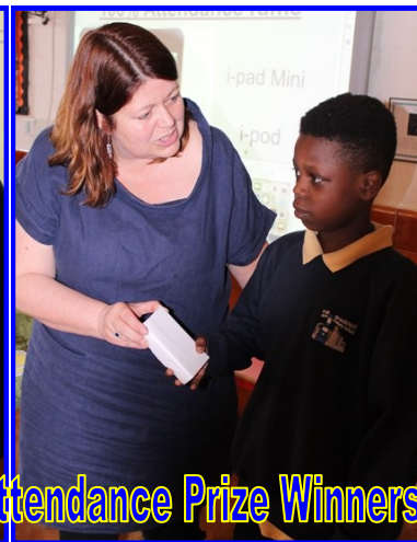
Spring Term 100% Attendance Prize Winners