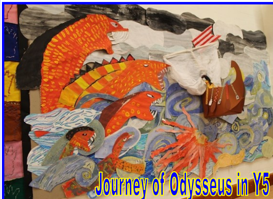
Journey of Odysseus in Y5

All the classes across school have been busy getting their class artwork ready to go up in the middle hall. The theme for this years hall art has been 'Journeys'. They should all be up by the end of today. When you come to 'Family Supper' on Wednesday November 4th you will all be able to see them in the flesh. Till then, here's a taster!