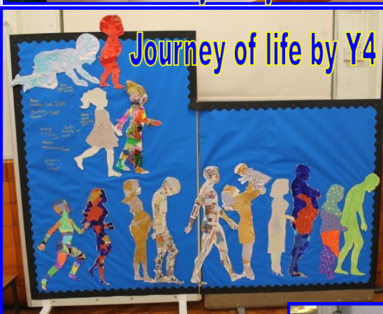
Journey of life by Y4

Last Friday we held our Poetry to coincide with National Poetry Day. Every class learnt a poem which they performed to the rest of the school in a special assembly. The teachers even learnt one to perform! The theme of this years Poetry Day was Light. We will have videos of each classes performance on the website soon for you all to enjoy.