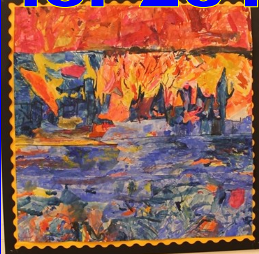
Jersey Class (Y2) working on their hall art piece inspired by the 'Great Fire of London' and the 'journey' it made across London. And above is their fabulous finished piece in watercolours.