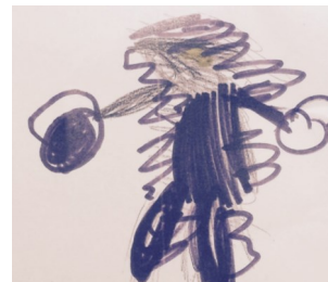
The Beast's are very rare