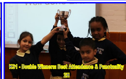
KS1 - Double Winners: Best Attendance & Punctuality 2H