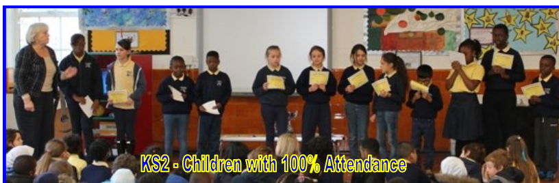
KS2 - Children with 100% Attendance